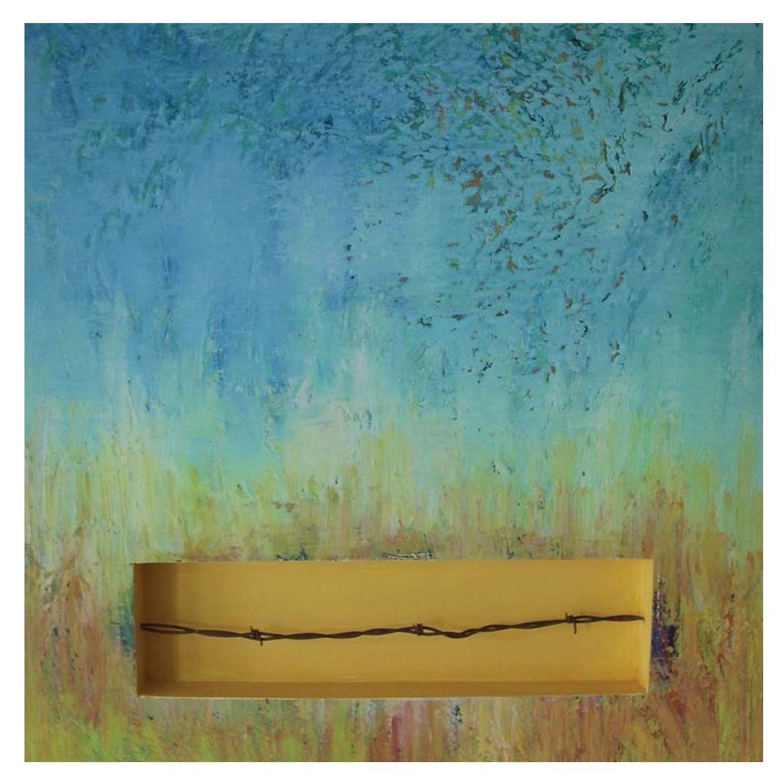
ARTIFACT NO. 5 WHAT REMAINS Cattle Marker, mixed media 24″ x 24″

for 50 cents," she says. "It was about big, bold, abstract, colorful stuff, which was a perfect medium for students."