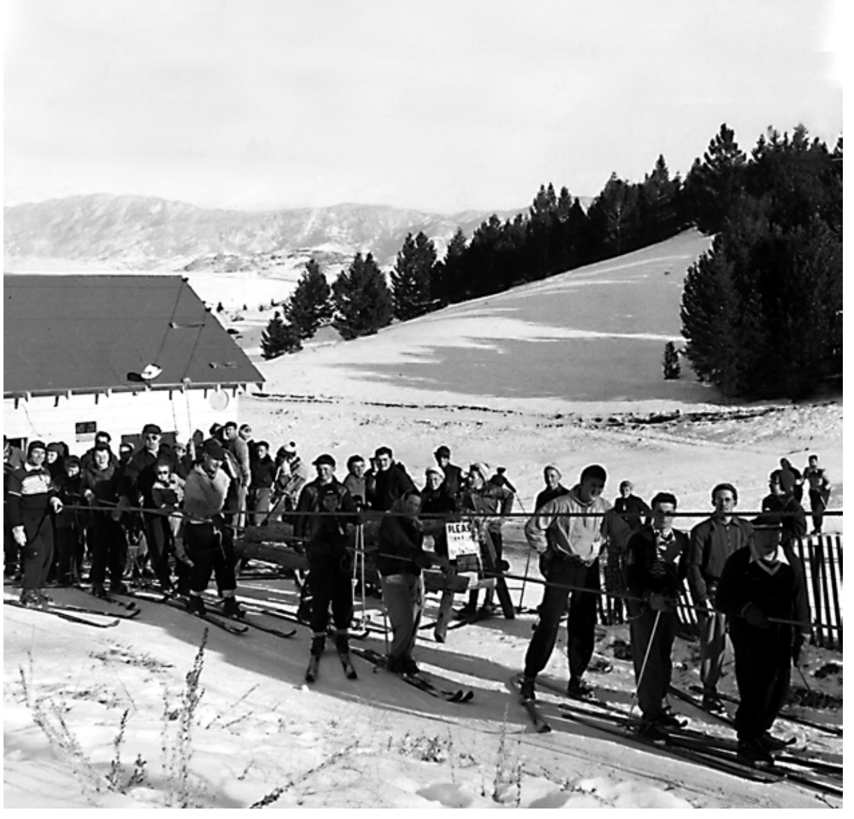
This page: Butte Ski Club members wait for a tow at Beef Trail, circa 1955. Facing page: Beef Trail beartrap bindings top. An original Butte Ski Club patch.

But eventually the age of chairlift skiing had hit the nation, and nearby Discovery Basin in Anaconda opened with lift service in 1973. As if a signal for troubles to come, lightning burned the tow shack on the Main Hill in 1974, but the other lifts continued to operate. The board of directors invested in a grooming machine in the