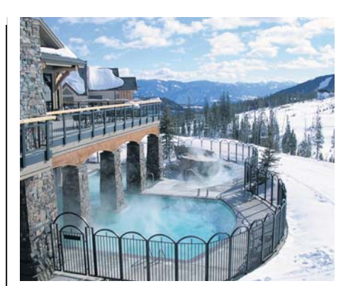
A WARM WELCOME The outdoor pool at Moonlight Basin lodge.

While the tram only services expert terrain, many people take the ride up and back simply for the view. From the summit I gazed out across three states; squinting, could even make out the Grand Tetons in Wyoming. The wind was blowing so hard