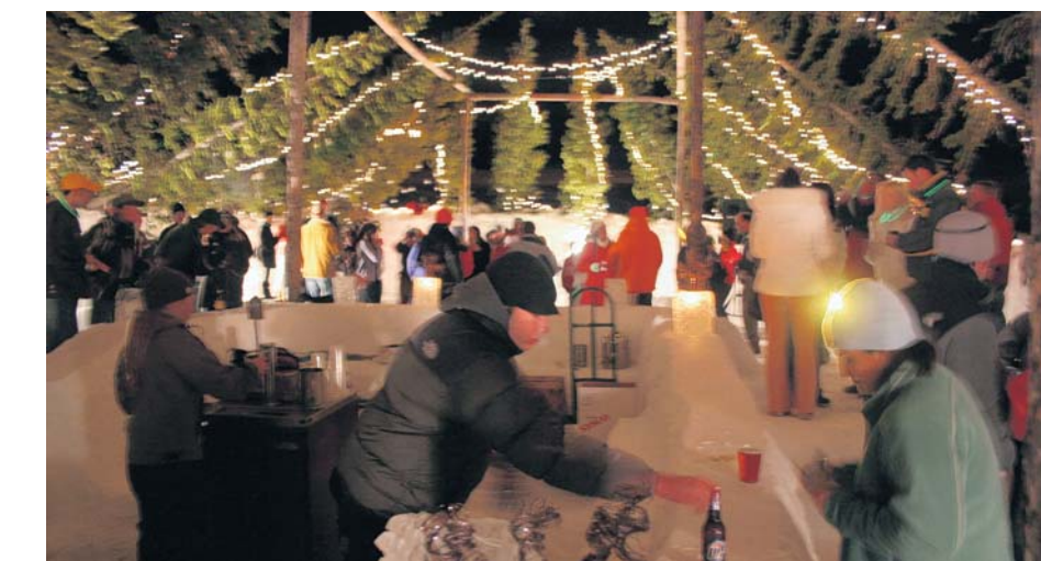
HAVE A COLD ONE A Big Sky bash with a snow bar and a deejay stage of ice.

Get access to Big Sky Resort and Moonlight Basin with a Lone Peak ticket for $79. At both resorts, children 10 and under ski for free. 1-800-548-4486 (Big Sky), 1-877-822-0430 (Moonlight Basin);