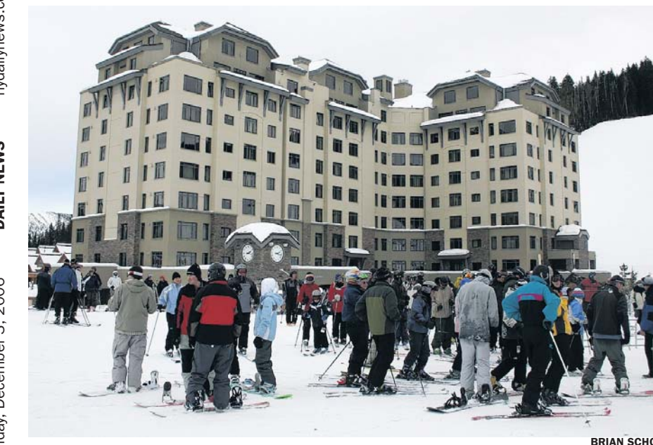
ROOM AT THE TOP Skiers assemble at Big Sky's Summit Hotel.

Two Montana resorts working together: a haven for skiers in search of fresh tracks